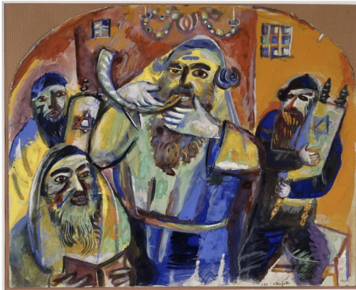
Marc Chagall's Le Shofar

Future deliveries will also be made on December 8 (Channukah) and March 16 (Pesach).